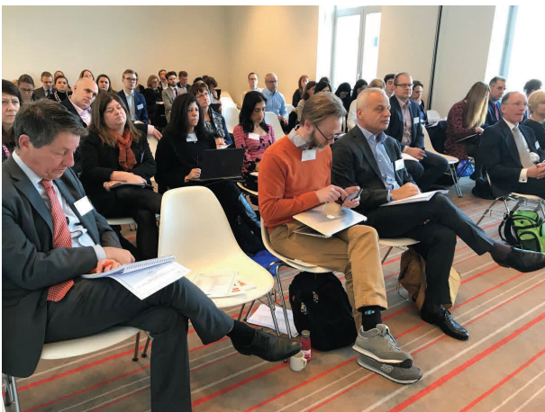
Participants discuss various topics relating to Profiling, Automated Decision-Making and Cross-Border Data Transfers under the GDPR

For more details on the working session, please see the working session agenda and slide deck .