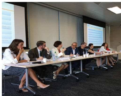
Panelists facilitate discussion on GDPR Impact and implementation during Session II of the Roundtable