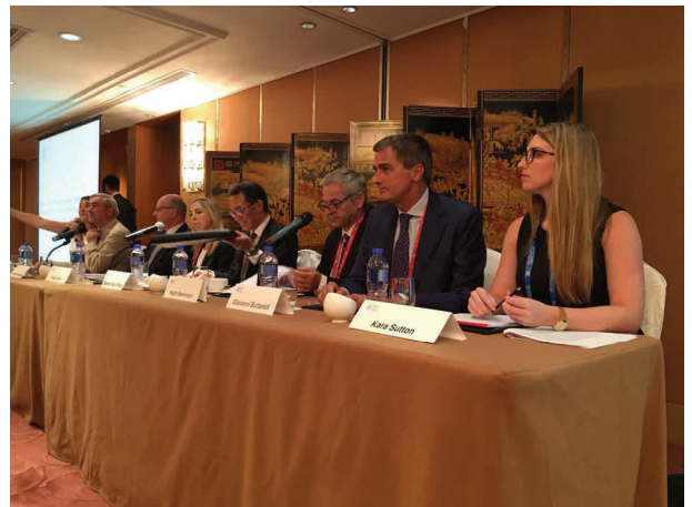
Panelists for “Regulating for Results” Side Event