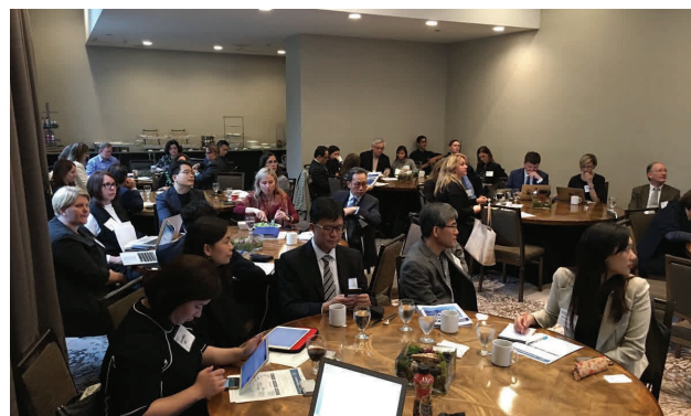
Participants discuss “Requisites for Trust in the Digital Economy”