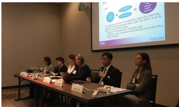
Panelists lead discussion on “Necessary Legal Grounds for Processing and Transparency”

For more information on the side event, please see the side event agenda .