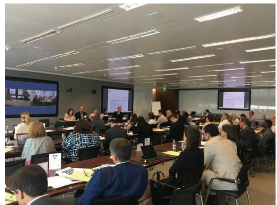
Participants discuss Accountability and Machine Learning during CIPL Annual Executive Retreat

The Retreat began with a CIPL members-only closed session on 19 July to discuss the state of GDPR implementation. On 20 July, the Retreat's open session began with a panel discussion on the potential impact of the proposed EU ePrivacy Regulation and its interaction with the GDPR. Other topics included a panel on accountable machine learning and AI to explore possible avenues for future CIPL work on this topic, and a panel on regional privacy updates from Canada, the Asia-Pacific and Latin America. The final panel session explored the new US Administration's approach to privacy and data protection.