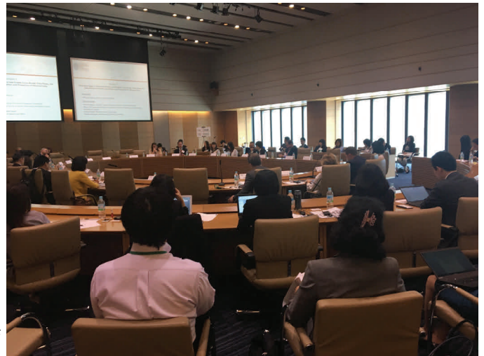
1st Panel of CIPL's Japan Privacy Workshop

The workshop allowed participants to hear directly from regulators regarding their interpretations of provisions of the Amended Act on the Protection of Personal Information, which were drafted with the goal of maximizing the utility of data while simultaneously respecting individual privacy.