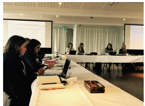
Participants discuss examples of profiling in different sectors during CIPL Roundtable in Stockholm

On 24 October, CIPL held a roundtable on "Accountable and Responsible Machine Learning under the GDPR and Beyond" in the margins of the 2017 Nordic Privacy Arena in Stockholm, Sweden. The roundtable focused primarily on two topics: "Machine Learning and the GDPR", and "Organisational Accountability in Emerging Technologies". Building on discussions at the main Nordic Privacy Arena event the preceding Monday, the roundtable included representatives from Nordic data protection authorities (DPAs) as well as privacy professionals and experts from leading local and global companies.