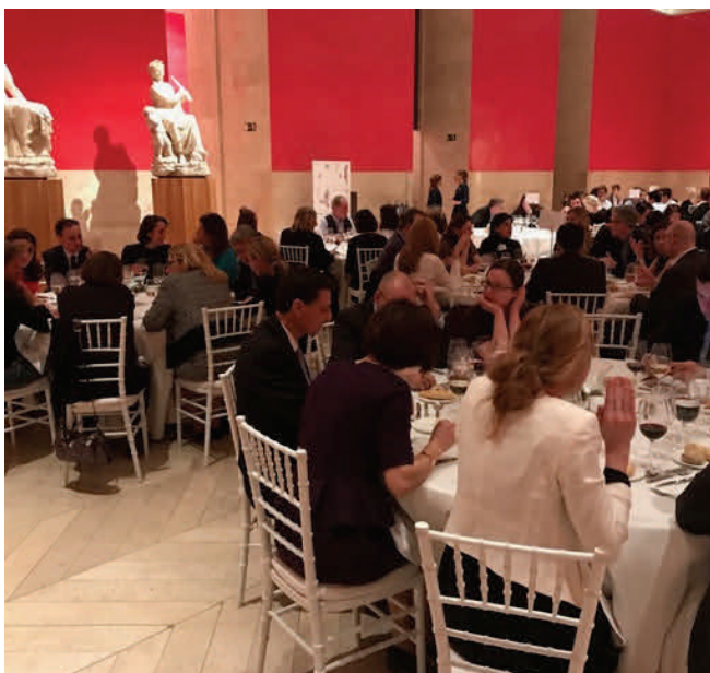
Workshop attendees enjoy a private dinner at the Prado Museum in Madrid

For more on the outcomes of the workshop, please see the workshop agenda , as well as three papers prepared in connection with the workshop: CIPL Madrid Workshop Key Takeaways , GDPR Implementation Challenges: A Summary of CIPL GDPR Project Participants’ Feedback and CIPL Examples of Legitimate Interest Grounds for Processing of Personal Data .