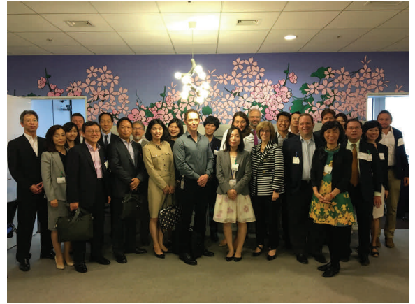
CIPL APEC CBPR Roundtable Participants

For more details on the roundtable, please see the roundtable agenda .