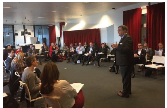
Participants discuss how to minimise tension between data protection principles and applications of AI

On 23 October 2018, CIPL held a closed, CIPL-members only roundtable on Artificial Intelligence and Data Protection in the margins of the 40th International Conference of Data Protection & Privacy Commissioners (ICDPPC). During the roundtable, CIPL members held an open discussion on data protection challenges associated with AI and machine learning applications. Participants discussed the issues addressed in CIPL’s recent white paper entitled “ Delivering Sustainable AI Accountability in Practice: Artificial Intelligence and Data Protection in Tension ”, focusing on how certain data protection principles may be in tension with the effective deployment of AI tools.