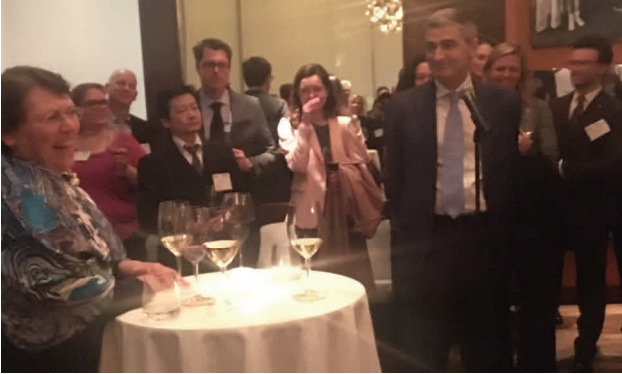
Giovanni Buttarelli, EDPS speaks to the necessity of a modern approach to digital ethics.

CNIL and former WP29 Chair. Special guests at the reception also included over fifteen data protection authorities from Austria, Canada, the EDPS, France, Hong Kong, Hungary, Israel, Ireland, Singapore, and the United States.