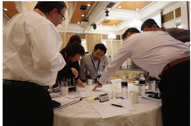
Participants discuss what regulators and organisations can do to ensure Accountable and responsible AI in breakout groups at CIPL and the PDPC's joint AI Working Session in Singapore