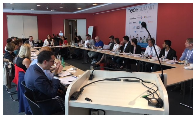
Participants discuss AI’s role in society and the challenges & data protection risks of AI at CIPL’s Accountable AI Roundtable