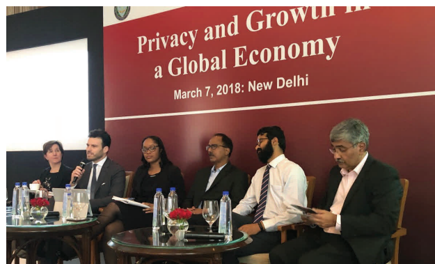
Panelists speak on adapting privacy to new technologies, automated decision-making and cloud computing.