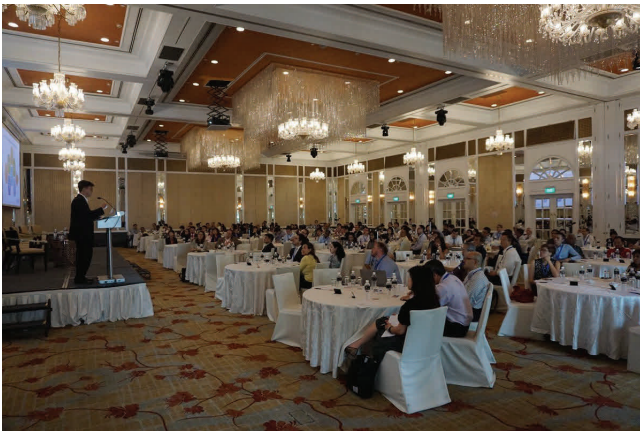
PDPC Deputy Commissioner Zee Kin Yeong issues opening remarks on Data Protection Trustmark Certification to kick off CIPL and the PDPC's joint Certifications Workshop in Singapore

For more details on the certifications workshop, please see the workshop agenda and slide deck . For more details on the AI working session, please see the working session agenda and slide deck .