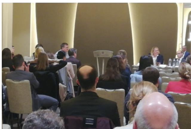
Participants explore questions about the concept of fairness in data protection at CIPL's ICDPPC Side Event in Brussels