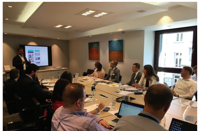
Participants discuss how the ePrivacy Regulation will affect user experience and how it will complement, overlap or contradict the GDPR