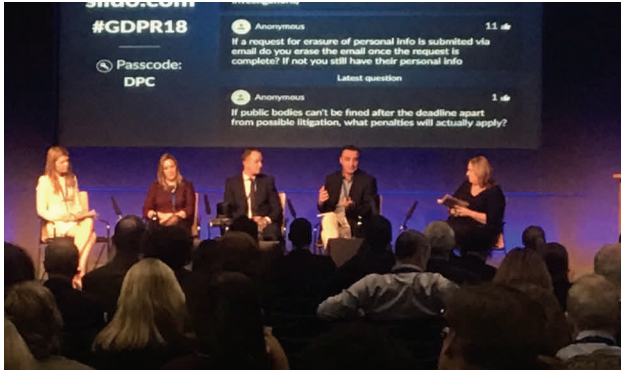
Panelists provide practical examples of how to implement key individual rights under the GDPR.

For more details on the delegation visit, please see the workshop agenda and slide deck .