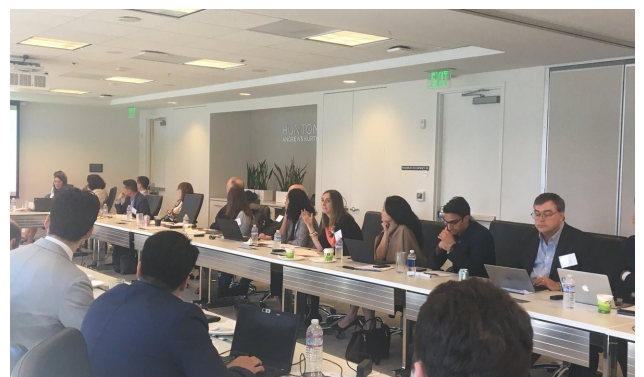
Participants discuss important global trends and developments in privacy law during CIPL’s Closed Retreat Working Session in San Francisco

On 26 June 2018, CIPL held a panel on Accountable and Interoperable Cross-border Data Flows as part of the 49th APPA Forum Open Session. The panel discussed the many requirements organisations have to contend with when transferring data across borders, the latest updates to the APEC CBPR system and the recently introduced US Clarifying Lawful