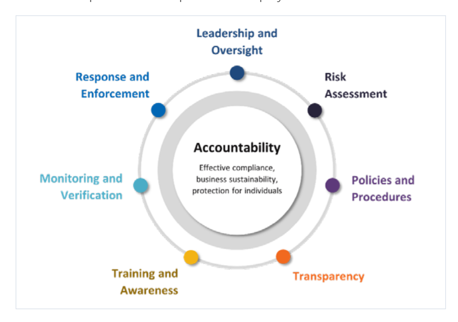
Figure 1. CIPL Accountability Framework

CIPL's Accountability Framework contains seven core elements of accountability: leadership and oversight; risk assessment; policies and procedures (including on fairness and ethics); transparency; training and awareness; monitoring and verification; and response and enforcement (Figure 1). This framework has been used by global businesses as a model for building comprehensive privacy and data governance programs, and it can equally be used in the AI context to build comprehensive governance programs that ensure responsible development and deployment of AI.<sup>8</sup>