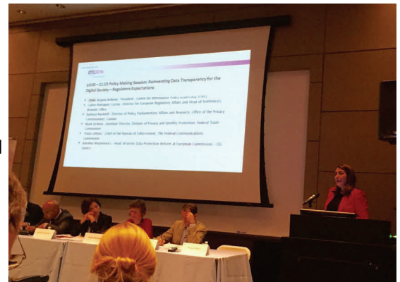
Bojana Bellamy summarizes Data Transparency collaboration across US and EU

The panel touched on many issues also addressed in the above-referenced CIPL/Telefónica white paper on “Reframing Data Transparency.”